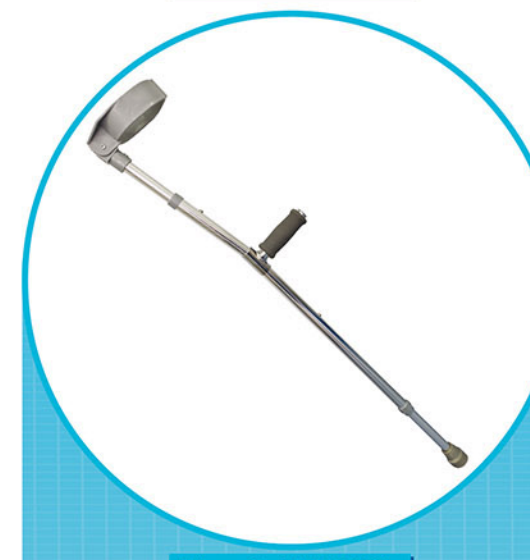
Elbow Crutch MF6701